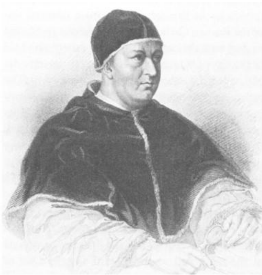
Figure 4: Pope Leo X

It was the members of the Council of Nicea, in 325 AD, who distorted and corrupted Jesus' true teachings. Jesus never intended to build a religion around him, and had no wish to be worshipped. The Council knew they couldn't just pretend he never existed--it was too late for that--but they could distort and take out the most powerful teachings from the Bible and then make the rest into a religion. So long as people worship somebody and give their power away to someone else instead of finding the power within themselves, the PTB are safe. Let the fools worship, they thought. In fact, it was an ingenious move on the part of the Power Elite, and "this myth of Jesus has served us well" , as one pope allegedly said a long time ago [15] .