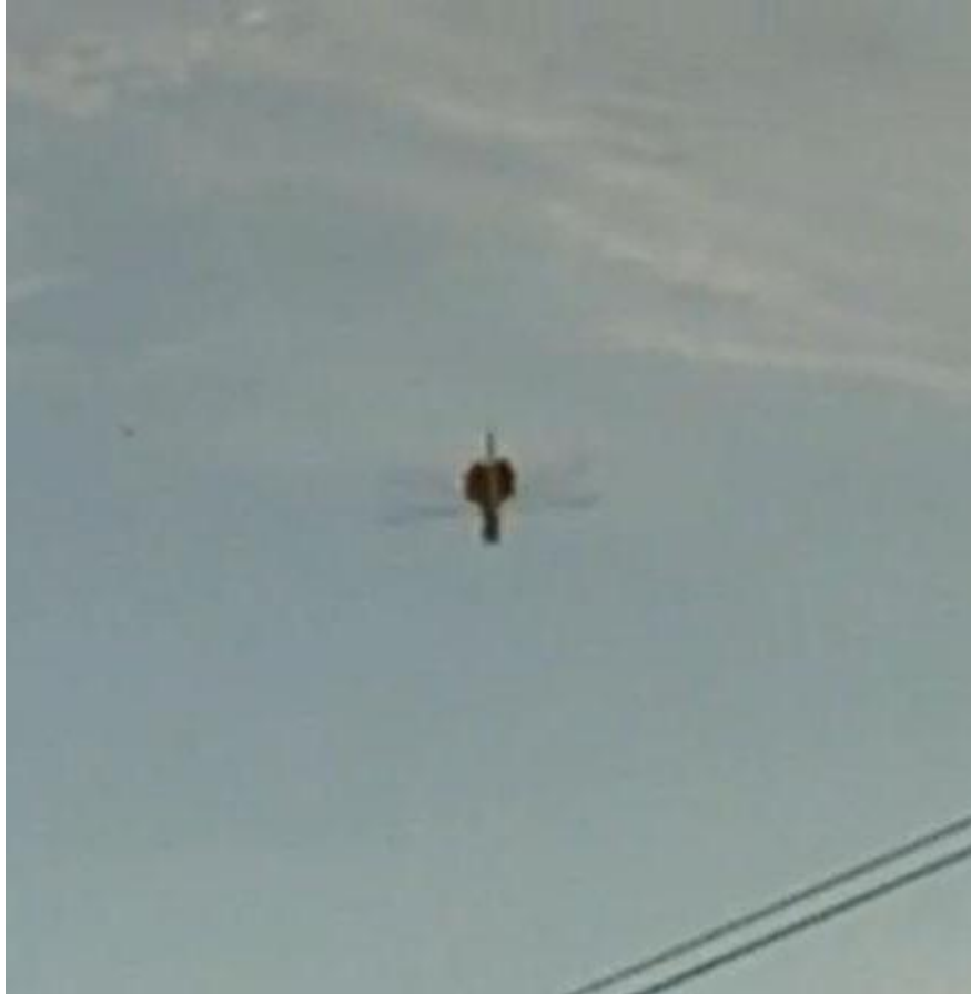
Figure 6: Dragonfly Drone

For a while, they will use drones (already do) in shape of dragonflies, hummingbirds etc., that will spy on us, but that's not going to be sustainable in the long run. I have had my share of drones lately; dragonflies that definitely are artificial. The same one followed me, picked me out several times in a line of cars, and later in the evening, when I was home and went outside, the same one was there (just like humans, dragonflies don't look exactly the same, but this one did). Still, I was miles away from where my first encounter was. The day after I was in a place totally different, and there it was again, flying close to my head. I told "it", "I know what you are and I know what you're doing. You can stop now!" It disappeared immediately and never came back. This drone was not really out to spy on me, hoping to find some classified material that I'm walking around with outdoors, it was simply there to intimidate. When it didn't work, it discontinued. They may find other ways, but I couldn't care less. No one, and nothing can stop me at this point from going where I want to go.