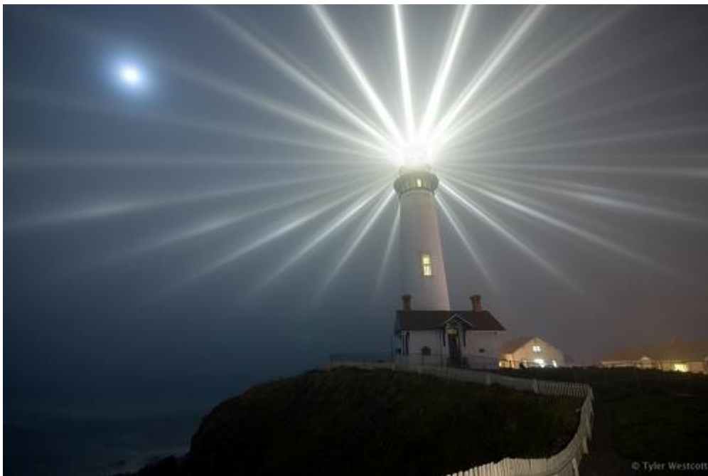
Figure 1: Be a lighthouse in the dark

Most people in this world are trying to adjust themselves so that they can be loved by others and prove that they are worthy to be loved. This is a huge misconception, and this is not why we're here. We are here to learn how to love ourselves! Once we have accomplished this, we can love others, unconditionally, and others, who have done the same thing, can love you back unconditionally, too. Still, you will find that by loving all and everything around you, you will help raising the frequency of everybody else (except those who aim in the other direction). Another misconception is that you always have to do what other people expect from you; if they ask you to build a house for them when you really have no obvious way of doing so with everything else going on in your life, it's okay to say "no".