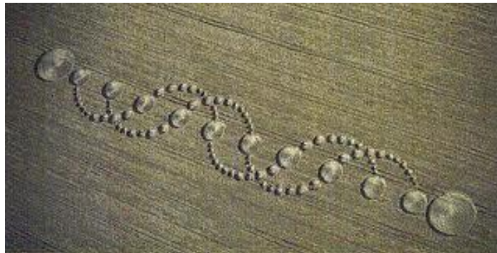
Figure 3: Crop Circle in shape of the double helix

Going back to the crop circles; even if a small percentage of them are made by spaceships, the majority of them are not made that way. Because consciousness has many shapes and forms, they often come as a wave. The Pleiadians were talking back in 1992 about a "wave of light" that eventually will hit the Earth and sweep it [6] . This is very interesting, because the scientists at LPG-C have now found out from ET races they have met with, that a wave from a supernova will hit us around November-December 2012! They are quite concerned about this and are not sure how humankind will react to this wave, and what will happen to Earth. Will this be the End of the World? [7] I will discuss the "Wave of the Supernova" in the following paper, and it's possible negative and positive implications.