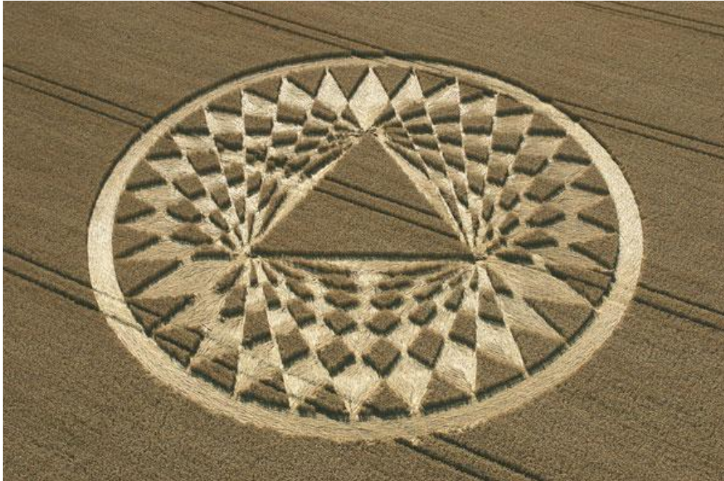
Figure 2: Crop Circle with geometrical shapes

The genuine crop circles are often created in geometrical shapes. Some of the shapes, like the circles, Merkaba, heptagon, and pentagon etc, we recognize immediately, while other shapes are unfamiliar to us at this time, and we have a tendency to not even notice them in the crop circle formations. These formations are a frequency more than anything else; not a process or an action by some huge spacecraft or flying saucer from our 3rd dimensional universe. They are imprinted in the fields by the Tribes of Light or those who work with them, to establish a particular frequency. In 1992, the Pleiadians said that these crop circles are going to increase in numbers over the years, and indeed they have [5] .