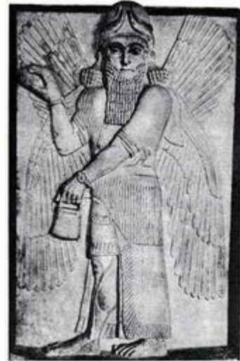
Figure 1: Anunnaki

What resonates with me, and always has, even before I read any information on it, is that we were already evolved beings before the Anunnaki came down here and started genetically altering us. There are quite a few sources who agree with this statement; both metaphysical (via channeling), and sensory data streaming [2] *. Earth is an Experiment, and what we today call homo erectus was a part of that experiment. These, our forefathers, were seeded by the earlier creator gods, like the Vegans, Lyrans, and their cousins, the Pleiadians, in conjunction with reptilians, insectoids and others. We see homo erectus as primitive, because they supposedly didn't live in cities and didn't have technology. However, you who have read one of my previous papers, Genesis Paper #1: Human Origins and The Living Library , know that they were in charge over a highly evolved civilization and they carried 12 strand DNA, fully activated.