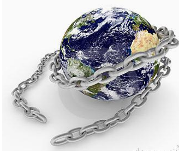
Figure 3: Earth in chains

limited, controllable frequencies; the ones necessary for us to be able to function as a slave race for the gods. The physical frequency fence (which according to David Icke is controlled from the Moon by the Dracos [and I would say the Ša.A.M.i. as well. Icke looks at these two races as one, which is incorrect]) makes it very hard for the frequencies of light (information) to penetrate. There were times when light frequencies could penetrate after the fact we'd been unplugged, but there was no one there able to receive them. The light-encoded filaments were no longer organized, so the cosmic rays had nothing to plug into and hold onto ( Marciniak: "Bringers of the Dawn", p.17 ).