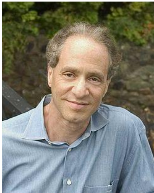
Figure 3: Raymond Kurzweil

There we go. If I didn't know better, I would be in awe that such a genius is born and manage to become a front-figure for the machine world technology. However, I know (and the reader who has followed my series of papers knows as well) that we all are born into this world by first setting goals for ourselves to accomplish in a certain incarnation. Of course, this is the case here as well.