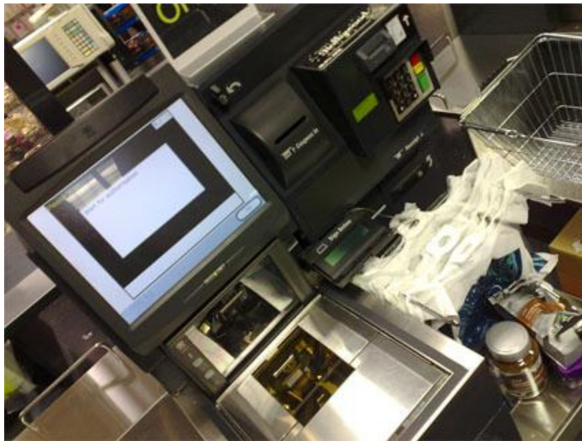
Figure 1: Machine Technology

I will say there will soon be a split in mankind, and this has to do with the new technology. There will be those who go for it, and those who choose not to be part of it. Machines will blend with humans so that they will become part machine and part human. This is of course not real to many people today, but is nevertheless what is planned, which I will show. This is nothing new; there are ETs out there who have already fallen into this kind of reality by their own doing or had others do it to them. Now they are trying to implement this on humanity as well. Later on we will discuss why this is introduced. For now, control over consciousness may be a clue.