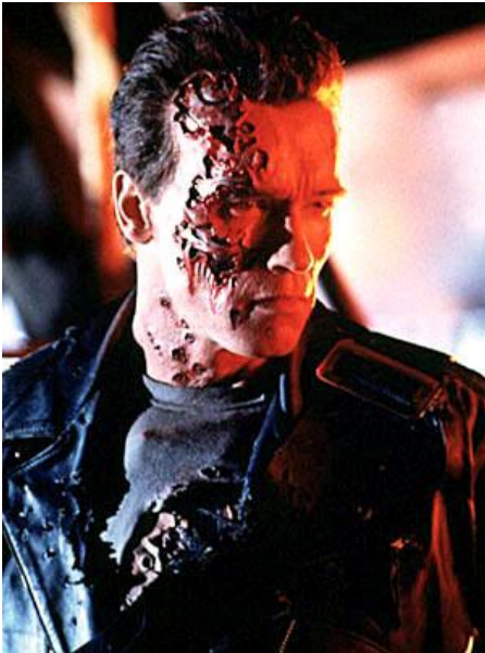
Figure 4: Arnold Schwarzenegger as the Terminator

The idea of a machine society has been introduced to us, as usual, by all open channels thinkable; Hollywood being the most effective media if you want to reach out to the masses. Robots appear in almost any sci fi movie worth its name since the 50s or so, but it has become more sophisticated over the last few years, where cyborgs often have taken the front seat in the plot. It started for real back in the 1980s, with Arnold Schwarzenegger's "Terminator" movies. Oh yes, this man, who later became the Mayor of California, knew more what was behind the plot of these movies than people think. His goal is with the Global Elite and he admires Hitler; he wants to be a dictator. He's admitted to this.