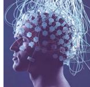
Figure 6: Visualization of the Machine Kingdom

What about if the gods are not able to evolve the same way we are? Perhaps they were not created to be able to do that because their creator gods created them for their purpose, which was not to have them evolve and ascend like us? So they use machine technology to reach what we can do naturally. They want our basic biology, but can't merge it with their own, because their biological structure is different. They can only evolve up to a certain point. Knowing that there is no way they can reach our potentials, they do what they can with their own genome, but on the other hand, they are created for power and control, so therefore they can't accept that we evolve differently from them. Besides, they feed from the fear they are creating in us and we are their food source. They don't want us to evolve, because when we're out of their frequency fence we are out of reach for them. They manipulated our DNA so that we wouldn't evolve and ascend easily, but our 12 strand DNA was already in our bodies, and they, to their own misfortune, only have 11 strands. [24]