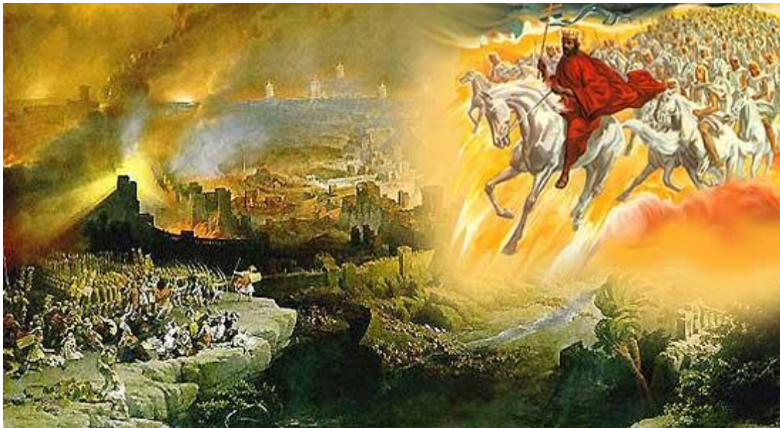
Figure 1: The Battle of Armageddon from an artist's perspective, where the King of Nibiru and his "angels" come down to fight the "Last Battle".

Marduk (equivalent to Satan), in his pride believes he can defend Earth against the Lords from Nibiru. He is well aware of what is planned and very savvy in Biblical Prophecy (after all, the Ša.A.M.i. dictated them). Just like what it says in the Bible, Marduk thinks he can win the battle with the help from joint military resistance, world-wide. He may declare Martial Law to fight this "hideous Invader Force". World leaders may ask civilians to take to arms as well to join in to "save the planet".