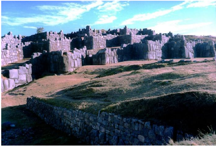
Figure 2: Sacsahuaman--A side view of the complex (click on image to enlarge)

them to return to Altiplano of Northeastern Peru, in the mid- to late second century of the Common Era to help Nannar' son, Utu to close down the smelter at Asacsahuaman as well as the dismantling of runway operations in the Nazca area of southern Peru. The smelter was still producing gold, tin and silver from distant and nearby sources from relocated Kassites (southern and central Turkey), the operation stopped before the first millennium of the Common Era. Some time in the sixth century CE, Sacsahuaman shut down and the pre-Incan civilizations from northern Peru through the region north of the Atacama desert in northern Chile were all left to fend for themselves. Other "colonies", like North American Midwest, southeastern and southwestern native groups who came in contact with and were instructed by the Anunnaki on agricultural, animal husbandry and other matters, were also disengaged and eventually abandoned in the seventh and eight century AD.