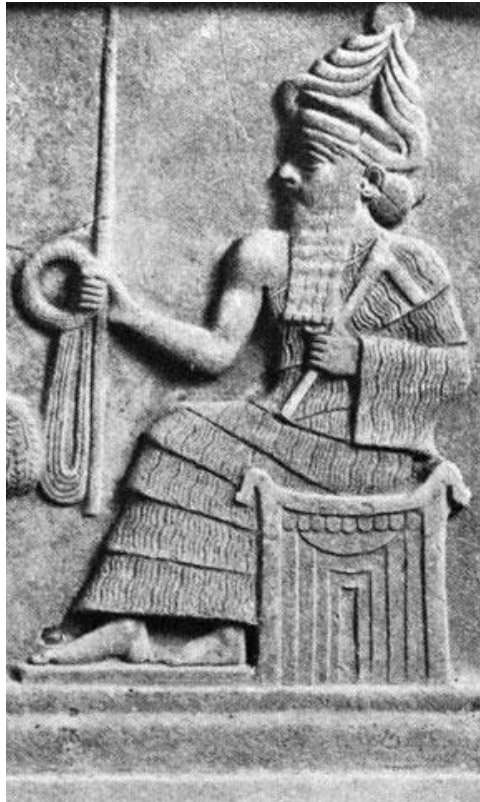
Figure : Nannar, King of Nibiru

It's not an easy situation for us here on Earth. The Living Library is desirable real estate, and it's been fought over since it was created, perhaps a billion years ago, or more, by the original creator gods. The question is, what should we do?