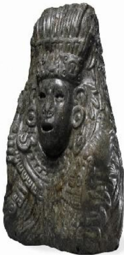
Figure 4a: Quetzalcoatl in human form

Now, when Marduk refused to obey to the rules, he was said to have been put in the equivalent of quarantine (common in Ša.A.M.i. culture under such circumstances when comes to Lords, they told). This did not stop him, however, and he continued to refuse to show obedience to any and all important laws and regulations of the Ša.A.M.e. Kingdom.