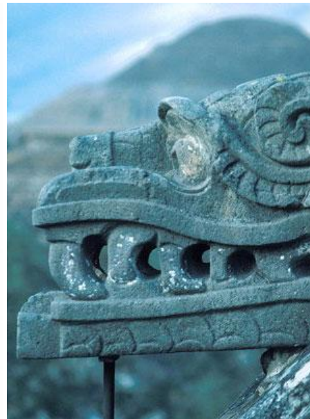
Figure 4b: Quetzalcoatl in reptilian form