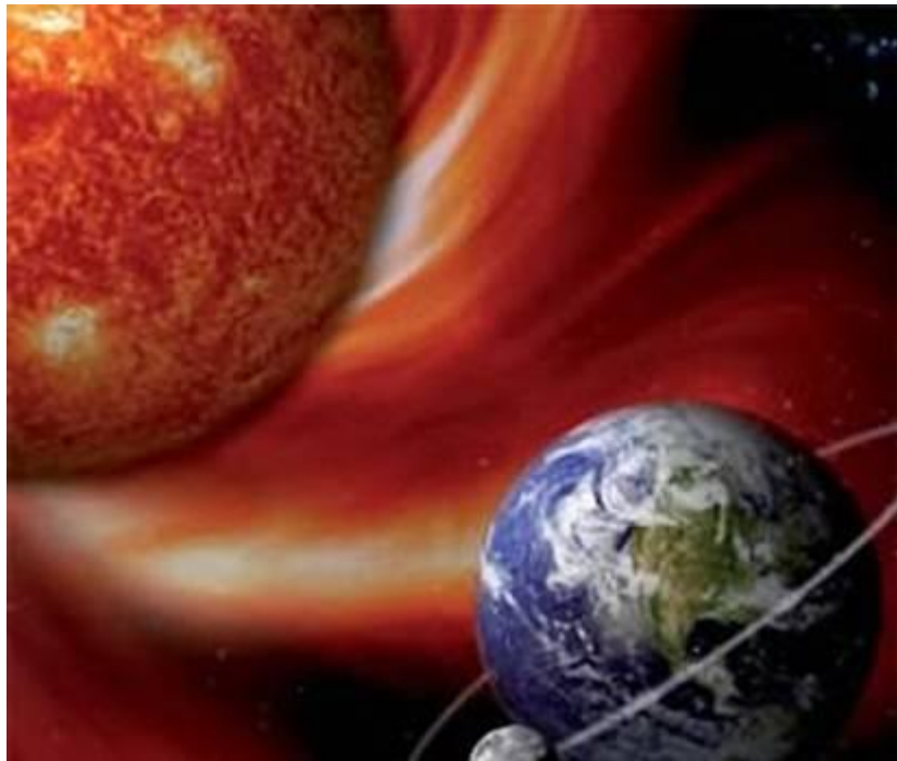
Figure 3 - Artist's interpretation of Nibiru passing close to Earth

These special times we are living in are very challenging for many; both for those who are thrilled by the incoming energies and learn from the light fragments carried on by the Sun, and those who are still not awake enough to recognize them consciously. There is no doubt that this dance of increased energies will also affect our environment, and it already does. Some people think that the Earth changes will soon cease to