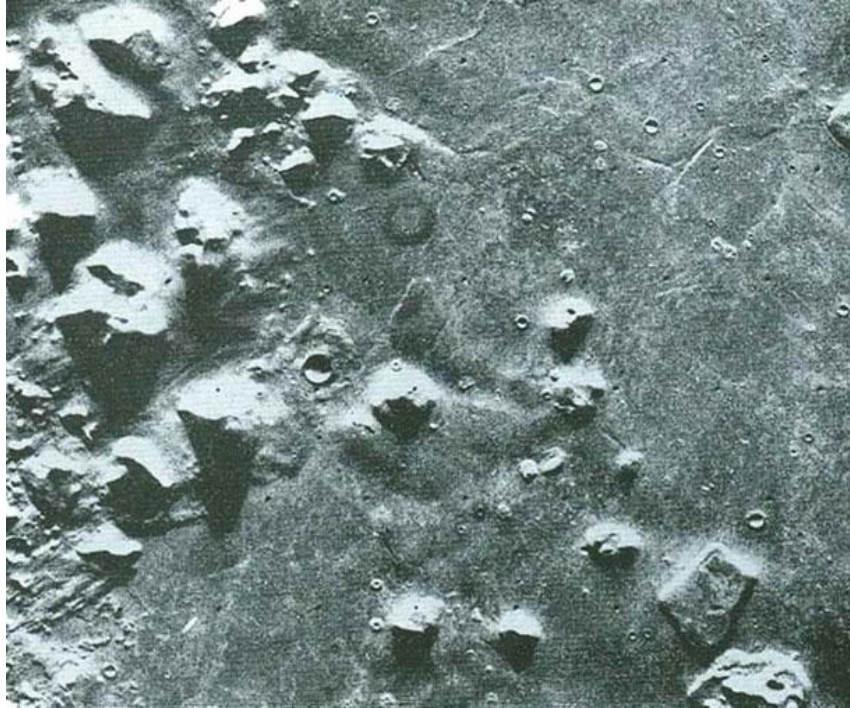
Figure 7a: Cydonia -- The Face on Mars and the environs