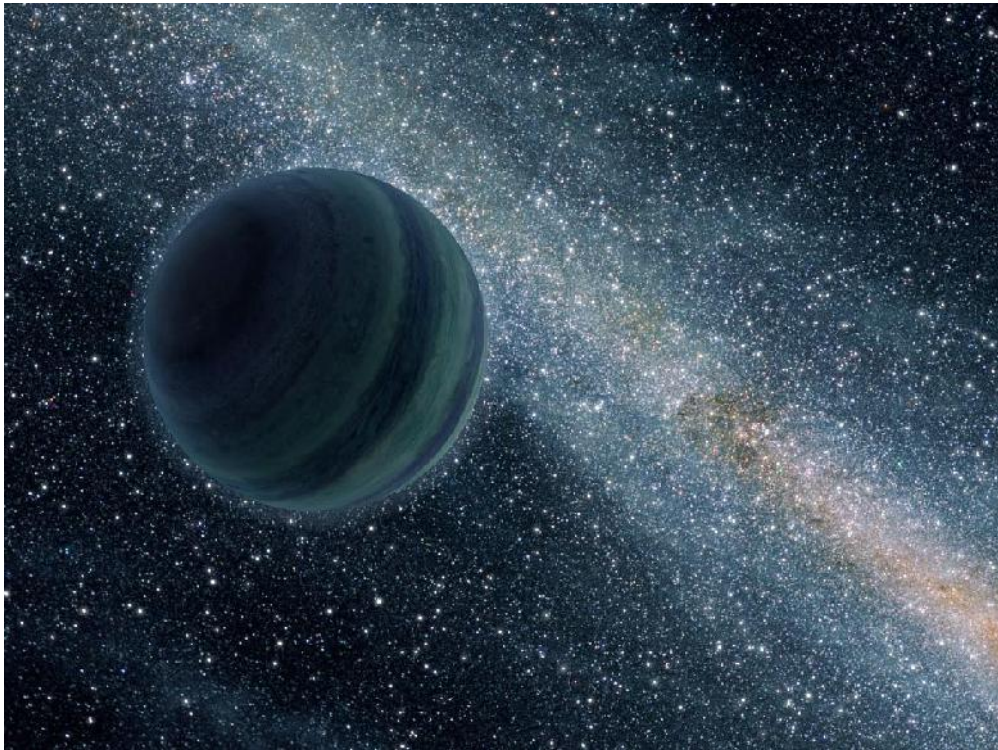
Figure 2: Orphan Planet

Another reason to give credit to Sitchin's work is because the gods are still here, and those from the home planet (Nibiru) are returning on their 3,600 years cycle, approximately around 2060-2095. More about that later. I have already mentioned the LPG-C being in direct contact with the Nibiruans, but they are not the only ones. There are more people who have had face-to-face (Close Encounter of the 5th kind) with these beings, something we are also going to cover in depth later on.