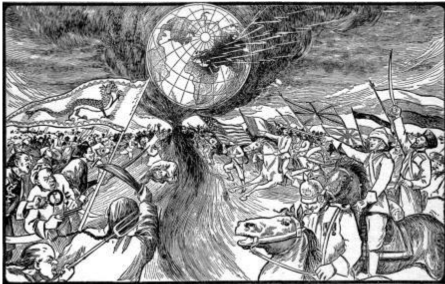
Figure11: Artist's vision of the Battle of Armageddon

Just for the record; this doesn't mean that everybody who has been working for a Global Elite Companies will be killed; only those who consciously work with Marduk and his clan. However, more people than we might think are part of the Marduk agenda; many celebrities "signed the contract", business leaders, religious leader, politicians; there are a lot of people who "sold their soul to the Devil" for fame and fortune, drugs, rock'n'roll and women in abundance.