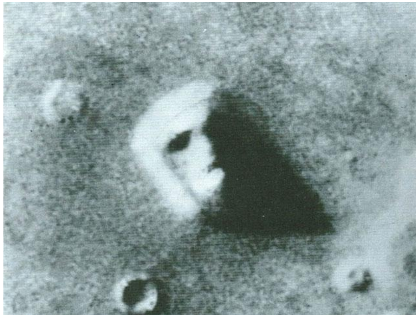
Figure 7b: The Face on Mars (close up)