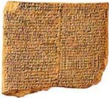
Figure 1: A Sumerian Clay Tablet

The first thing we need to understand when we read Sitchin's work is that he translated the Sumerian tablets into modern language, drew his conclusions and found the coherency in it. That's all he could do. The tablets were written some 5-6000 years ago, by the end of the era of the Anunnaki's 450,000 years reign, or more, on Earth.