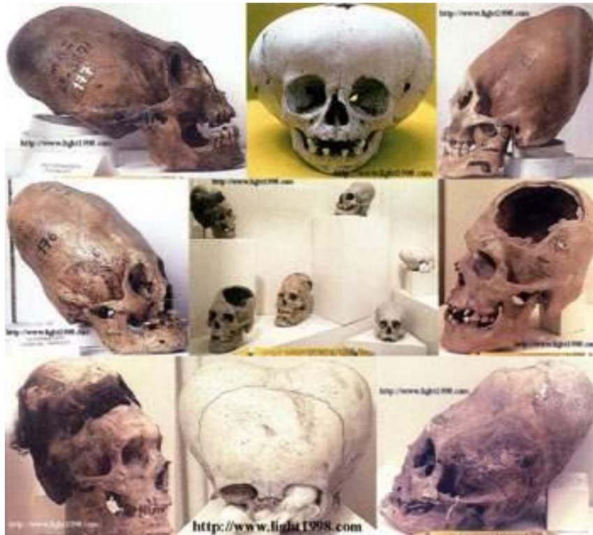
Figure 9: Giant Skulls from a museum in Lima, Peru (were some of them Titans?)

One thing to remember in our thirst for knowledge is that, to expand our consciousness it's not necessary to grasp everything there is to know. The logical mind is always wondering and pondering over things it doesn't understand. It is the unconscious mind that knows, and it's not "logical" in our terms, but non-linear and Multi-D.