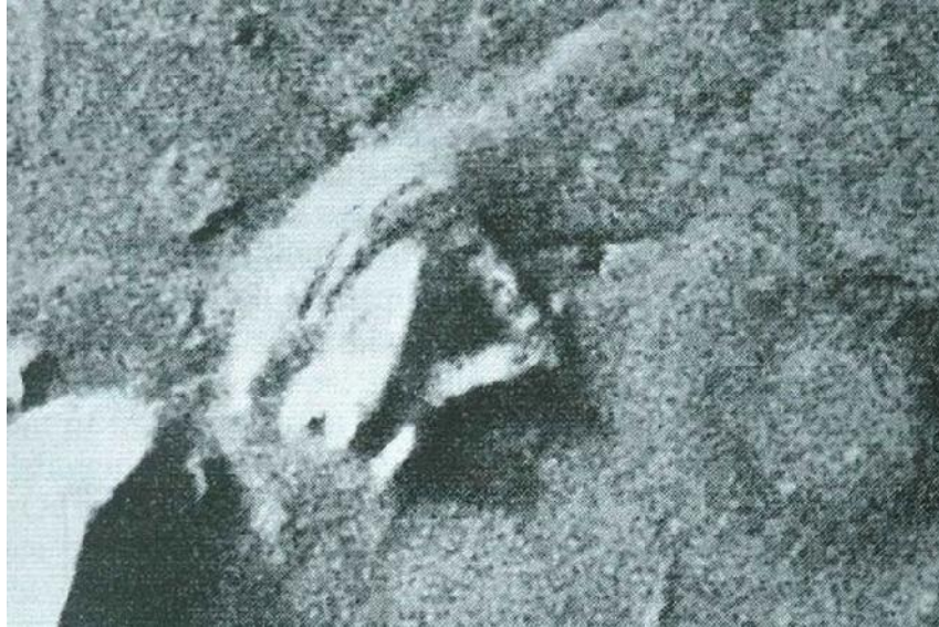
Figure 7c: Right angle building structure on Mars