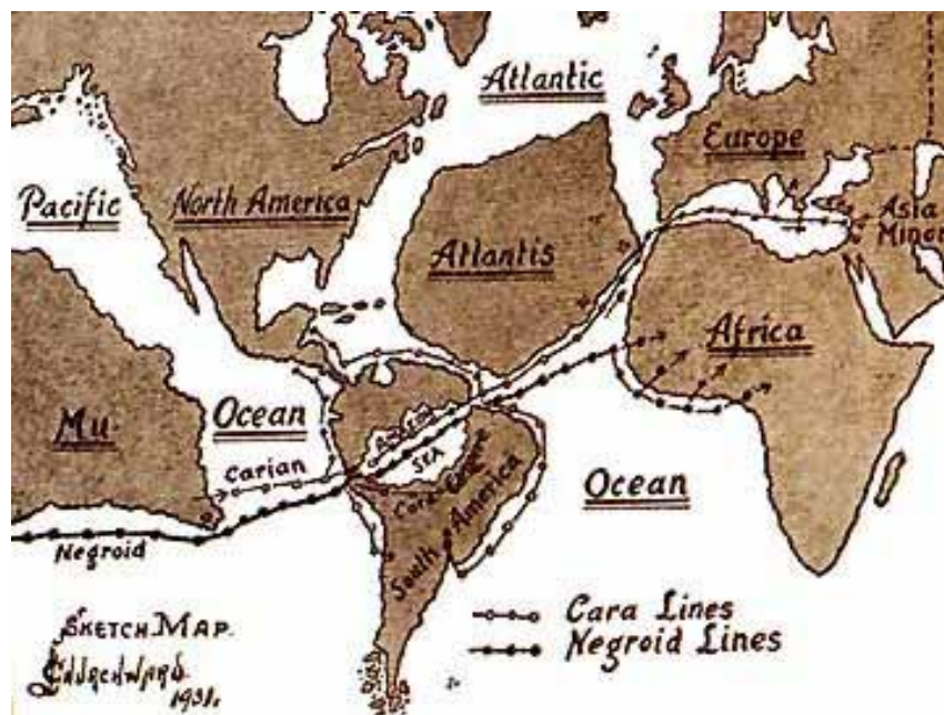
Figure 5: Old world map, including Atlantis and Lemuria (Mu)

In Sitchin's books it sounds like Earth is the only planet the Ša.A.M.i. visited, and they can do so because it's close to Earth every 3600 years (one šar). However, this species is not stuck in 3-D and can travel interdimensionally and are using stargates and Einstein-Rosen Bridges to go from one point in the universe to another. This is the most fundamental way of traveling through long distances in space/time. The Ša.A.M.i. are a warrior and a conquering race, and they have invaded other planets, both before and after Earth, as we shall see in the " Second Level of Learning ".