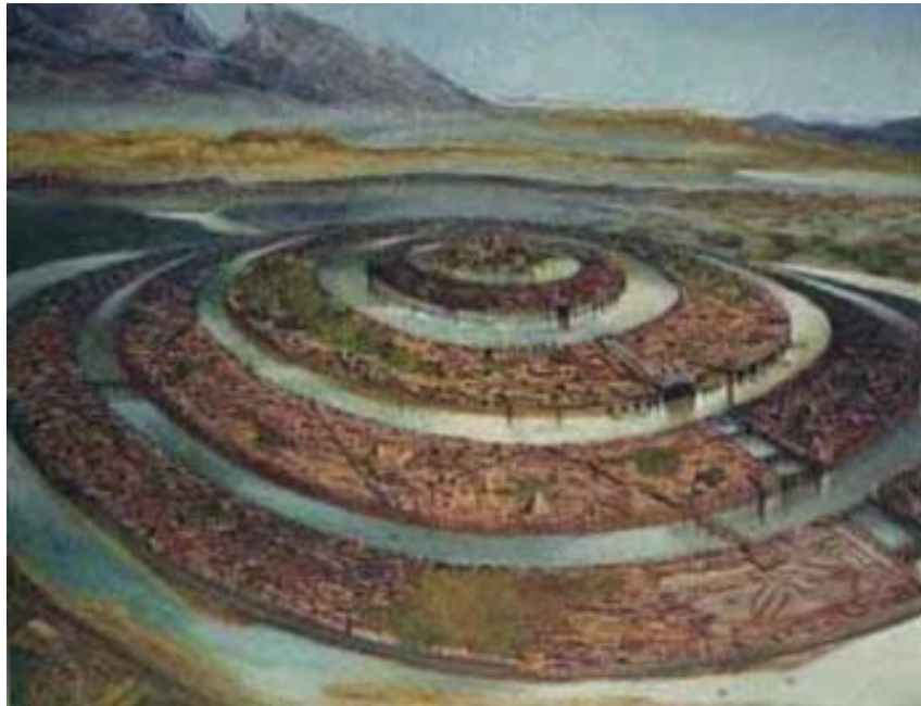
Figure 4: Atlantis