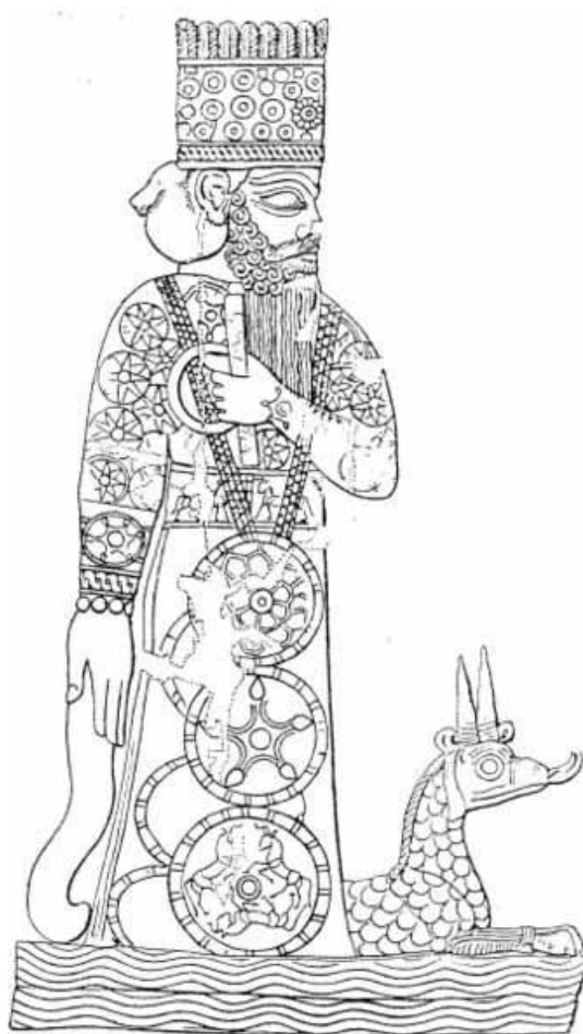
Figure 6: Marduk

To counter Marduk's actions, Nammur decided to find Ka-in's descendents and did so. He took them under his wings, taught them how to build balsam rafts, and they sailed with Ninurta to South America, where they learned about tin and gold mining. Because Marduk, offended and feeling neglected by the rulers on Nibiru, had openly stated that he wanted to be Master of Earth, Ninurta, his cousin on the Enlil side of the bloodline, felt he needed to prepare for whatever move Marduk may make, and so both sides built an army of humans, in case a war was around the corner. Marduk's intentions were twofold, at least. He wanted to build an army to show his power and that he was serious, and he also wanted to create a slave race for himself once the rest of the Anunnaki had left the planet. However, the tension between the two camps increased.