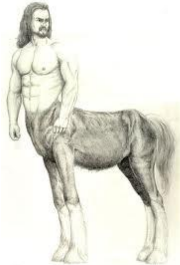
Figure 1: "Centaur" -- a crossbreed between Anunnaki and horse

Now, given free hands by King Anu, Ea and Ningishzidda immediately continued their genetic experiments to create the "perfect worker". Before they even came close to the end result, they tried different options. The most amazing creatures were created; such as the Centaur , which was a crossbreed between Anunnaki and wild horses, in an attempt to create the perfect work horse; strong and intelligent. That project was eventually abandoned, but this is where the myth about the Centaurs come from.