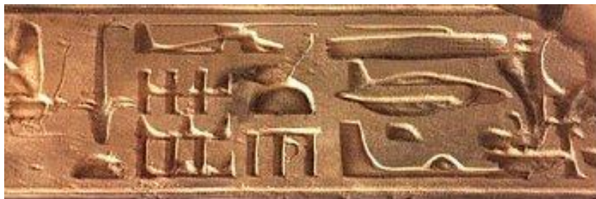
Figure 7: A helicopter at the top and other space shuttles and vehicles can be clearly seen in this extraordinary tablet!

13,000 years ago, the ice sheet in Antarctica slipped. Nibiru's netforce put it in the South Sea and as it melted, driven north, water started rushing at 650 million kubic feet per second. The storms whipped and the water rose quickly and killed everything in its way, except for Utnapischtim's ark, which floated on the waves for forty days and forty nights, until it got stuck on the top of Mt. Ararat. There they offered a lamb for Ea, and Nammur and Ea came down to meet them in "Whirlwinds", something which looked like modern helicopters ( fig. 7 below ).