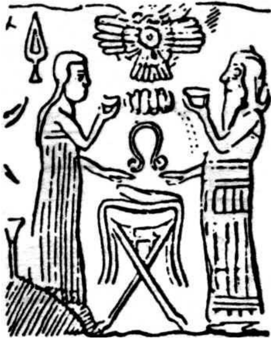
Figure 2: Ninmah and Ea creating zygote workers

Then, Ea came up with the idea to implant a test-tube-grown zygote into Ninmah's womb, containing his sperm, she who later was renamed Ninhursag by Ninurta, and became known as Isis in Egypt. When the baby was born, an excited Ea slapped the baby on his behind, and he gave out the proper sound. The baby could speak! The research team was very happy.