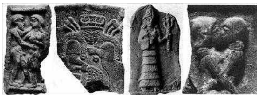
Figure 5: Ea impregnates two human females, who then gave birth to a son and a daughter, respectively; Adapa and Titi. In the second tablet from the left we see Damkina holding Adapa and Titi. The third tablet is most likely showing Damkina holding her favorite, Titi. In the tablet to the right, Adapa and Titi are mating, leading to Titi giving birth to Ka-in and Abael (Cain and Abel).

So, now the early humans were working in the cities as well as in the mines, and they bred uncontrollably. This created food shortage, which became a problem for the Anunnaki. Nammur, who was already angry with Ea for have created this species, now demanded his brother to come up with ideas to put an end to the food shortage and the rapid growth in numbers amongst the slave race.